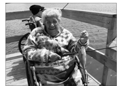
Deef was all smiles until she realized it was a "stinky cat fish"!