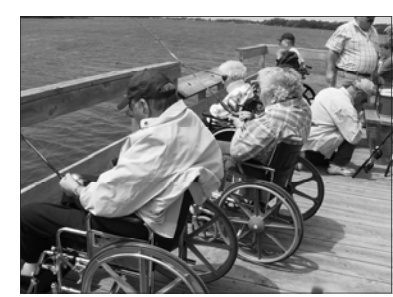
Serious about fishing

Thank you to our personal fishing guides from Reel Fishing who provided fishing poles, bait, and assistance removing fish off the hooks!